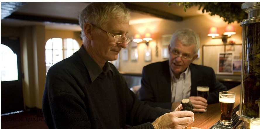
Up-market bar snacks? Brie with a layer of grated truffle