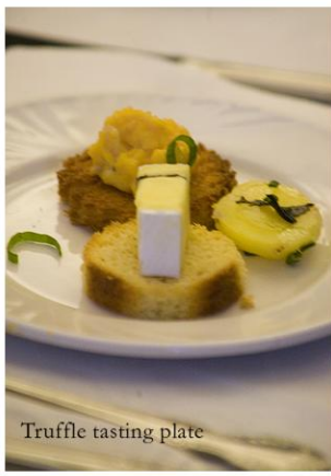
Truffle tasting plate