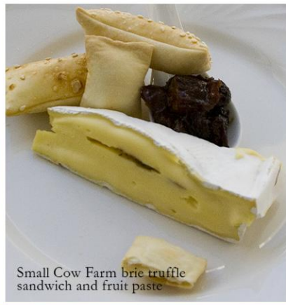
Small Cow Farm brie truffle sandwich and fruit paste