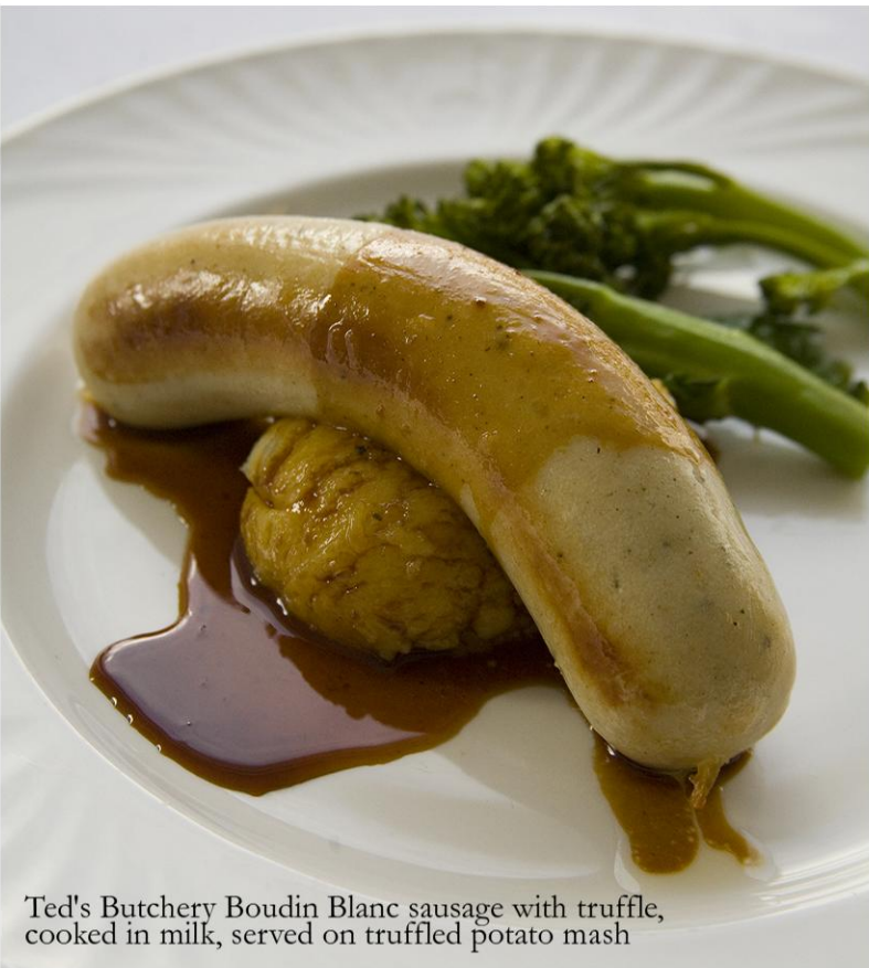
Ted's Butchery Boudin Blanc sausage with truffle, cooked in milk, served on truffled potato mash