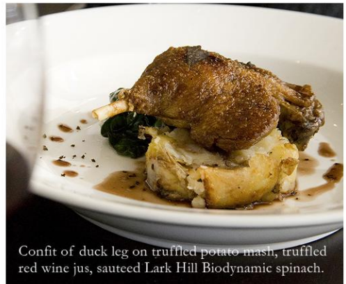
Confit of duck leg on truffled potato mash, truffled red wine jus, sauteed Lark Hill Biodynamic spinach.