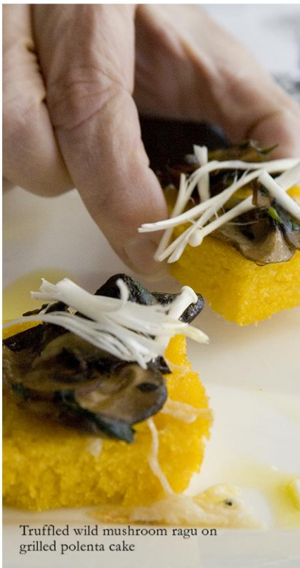
Truffled wild mushroom ragu on grilled polenta cake